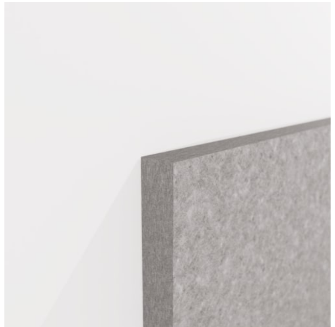
Panel 24mm (1inch) Detail