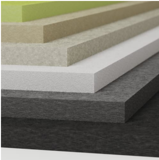
Panel 24mm (1inch)