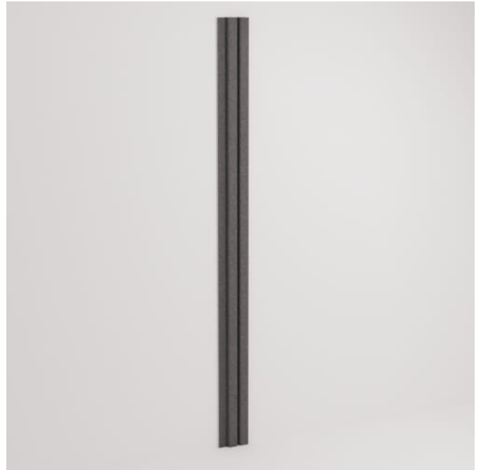
3D Panel Batten 2 Detail