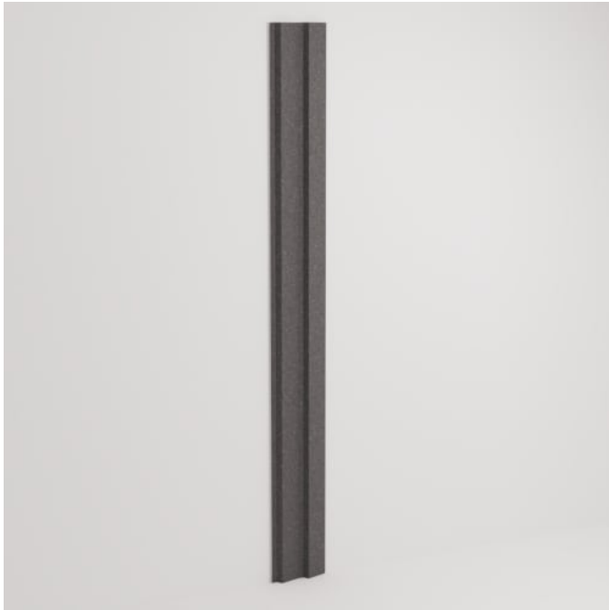
3D Panel Peaks Detail