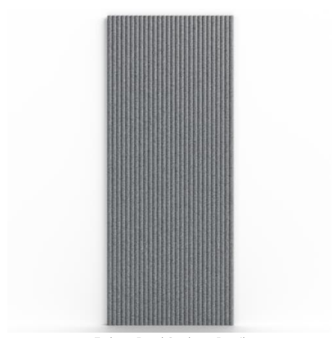
Emboss Panel Corduroy Detail