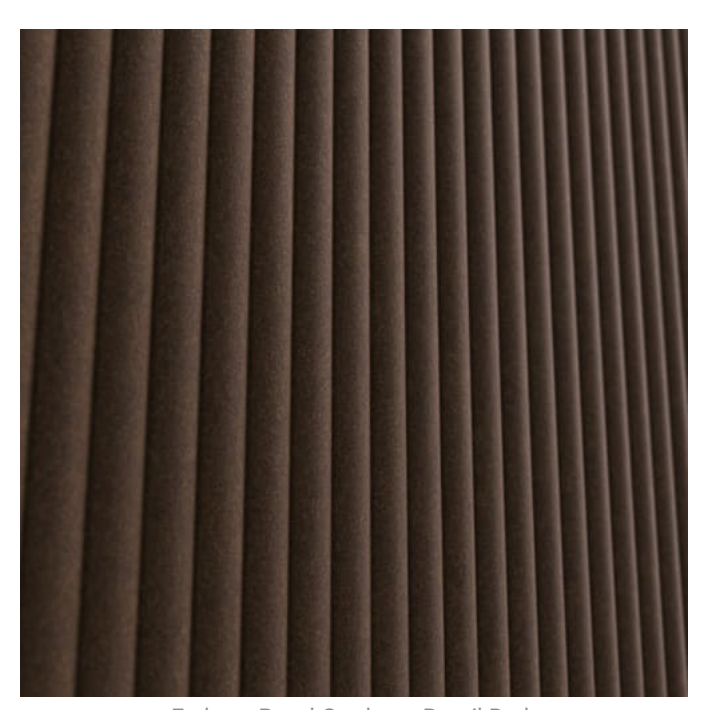
Emboss Panel Corduroy Detail Bark