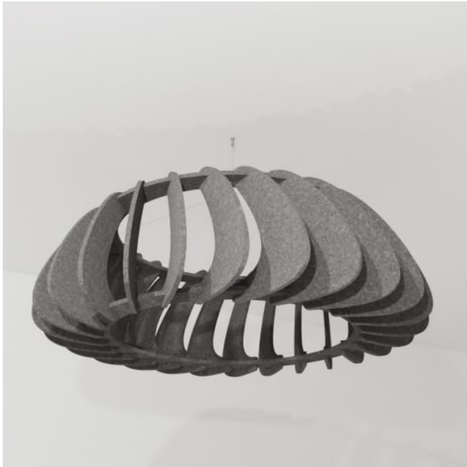
Clouds Turbine Detail