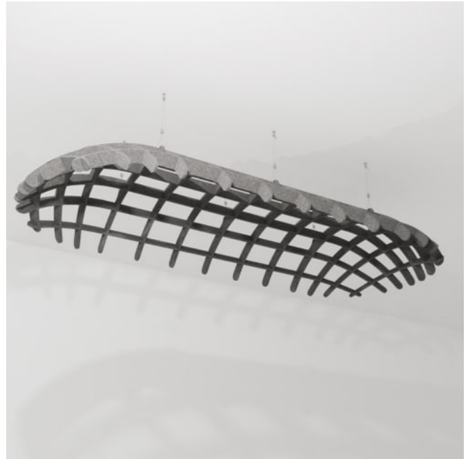
Clouds Long Dome Concave Detail