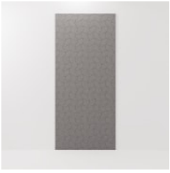
Etch Panel Sine Detail