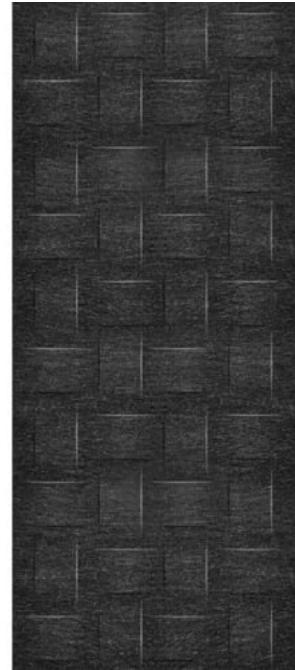
Texture Panel Tissage Panel