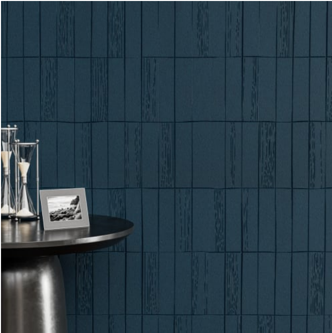
Organic Etch Panel Stacked Midnight