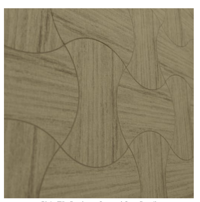
Plain Tile Battleaxe Spotted Gum Detail