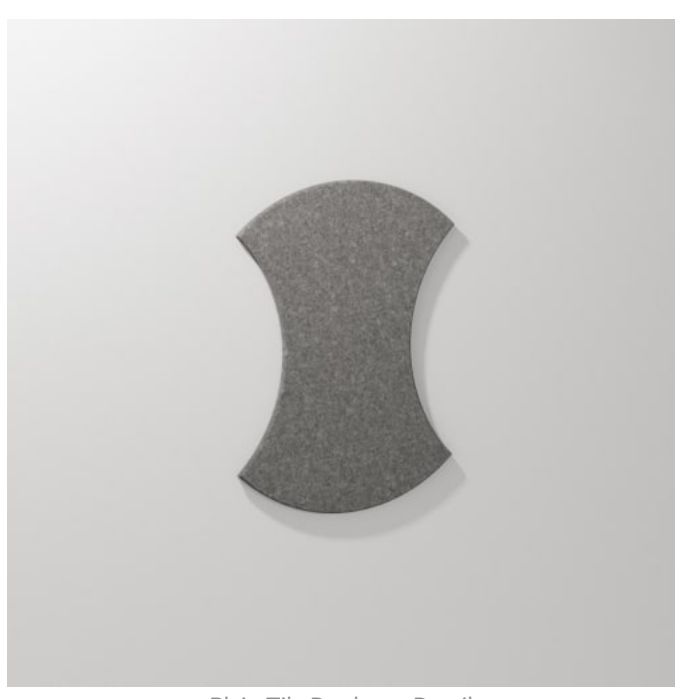
Plain Tile Battleaxe Detail