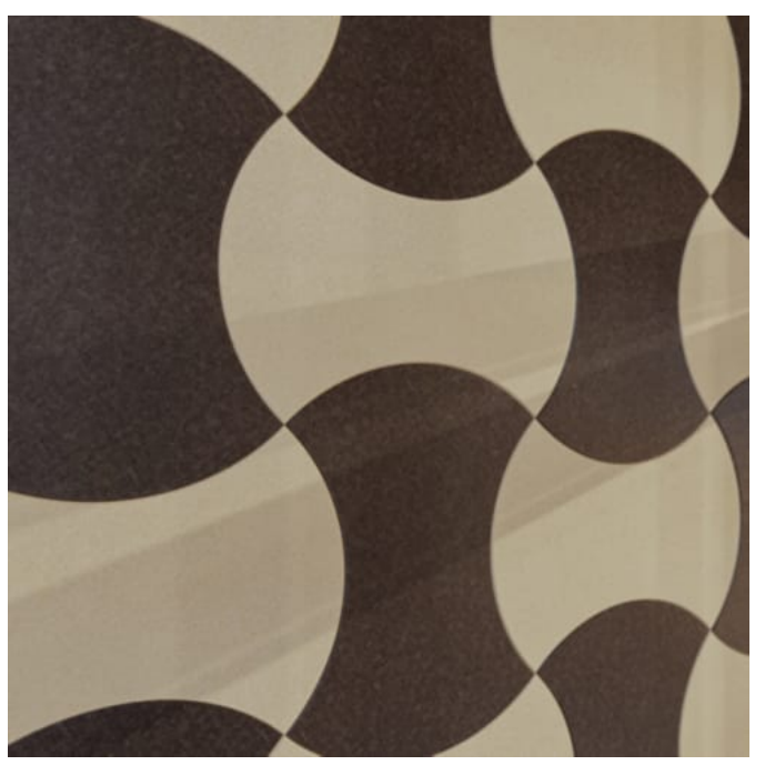
Plain Tile Battleaxe Slate Linen and Ecru Close Up