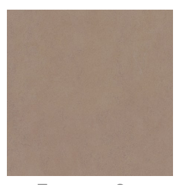
Terracotta Sun Bleached