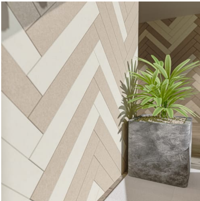
Plain Tile Tablet A Herringbone Install in Ivory and Ecu Close Up