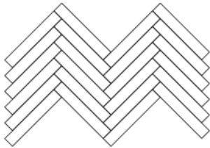
Assembly Suggestions Plain Tiles Tablet A