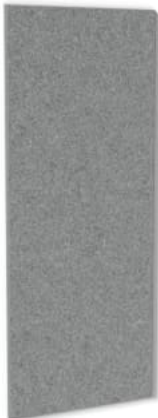
Plain Tile Tablet C Perspective View Detail