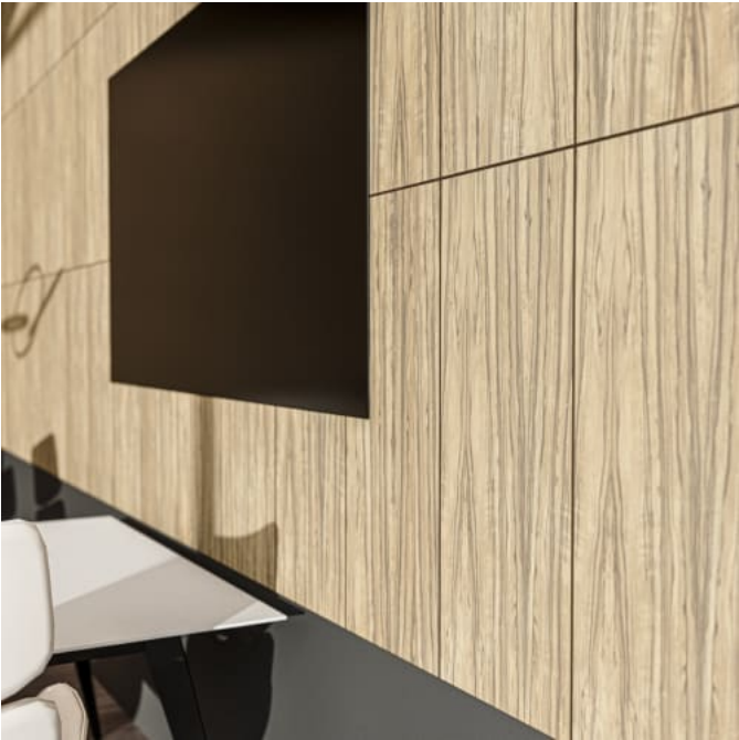
Plain Tile Tablet C Premium Wood Australian Walnut Close Up