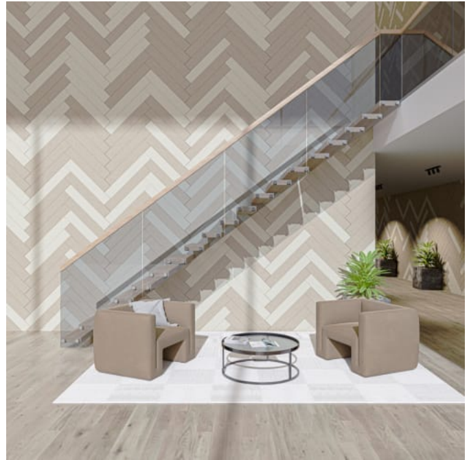
Plain Tile Tablet A Herringbone Install in Ivory and Ecu