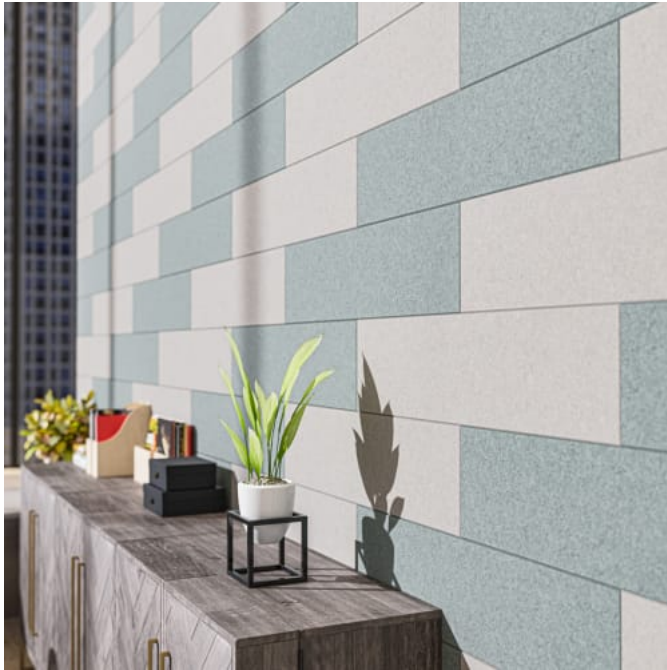
Plain Tile Tablet B Storm and Cadet Close