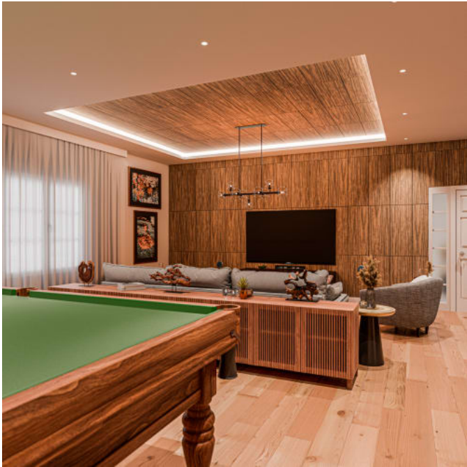
Plain Tiles Tablet Premium Wood Australian Walnut