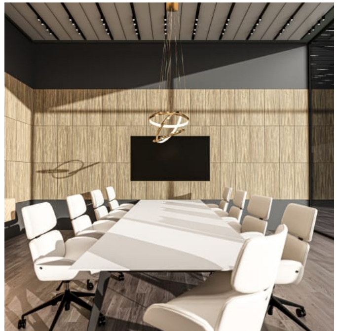
Plain Tile Tablet C Premium Wood Australian Walnut