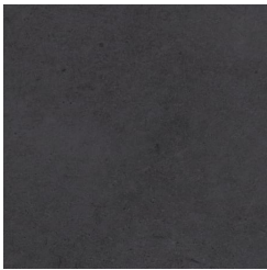
Concrete Dark Tint