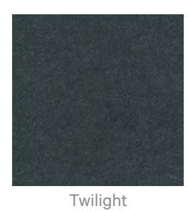
Zintra Timber Print