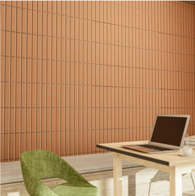
Etch Tiles Fluted Detail