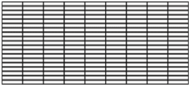
Assembly Suggestions Etch Tiles Fluted