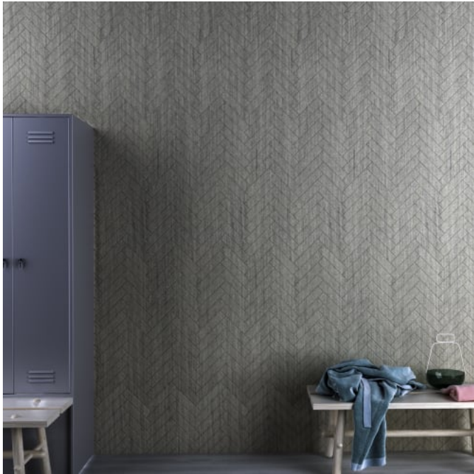
Etch Tiles Herringbone