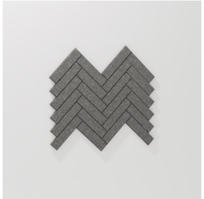
Etch Tiles Herringbone Detail