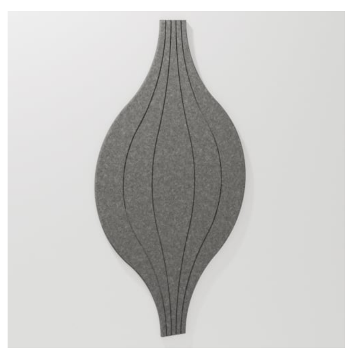
Etch Tiles Hourglass Detail