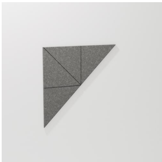
Etch Tiles Triangle Detail