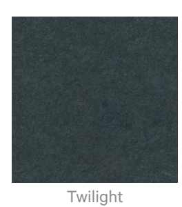
Zintra Timber Print