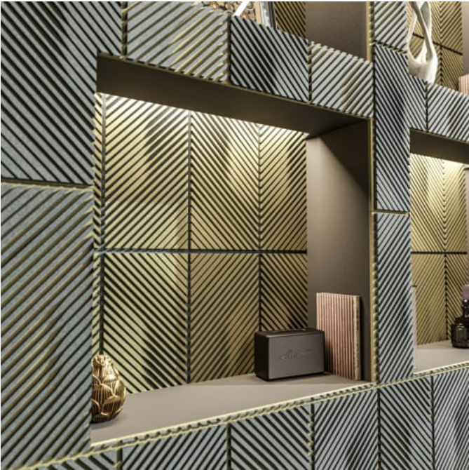
Pattern Tile Halftone Detail