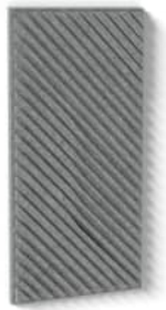
Pattern Tile Halftone B Detail 2