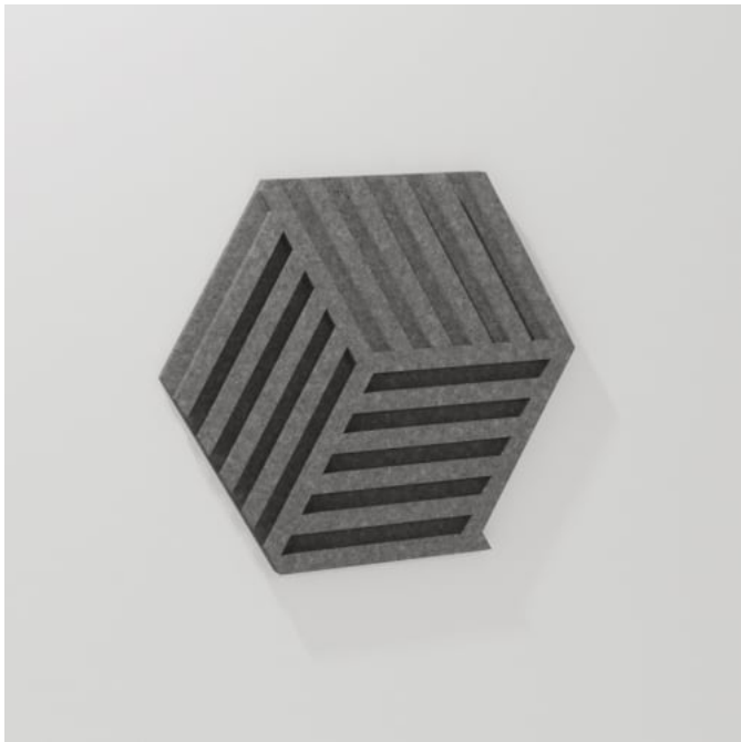
Pattern Tile Leap Detail