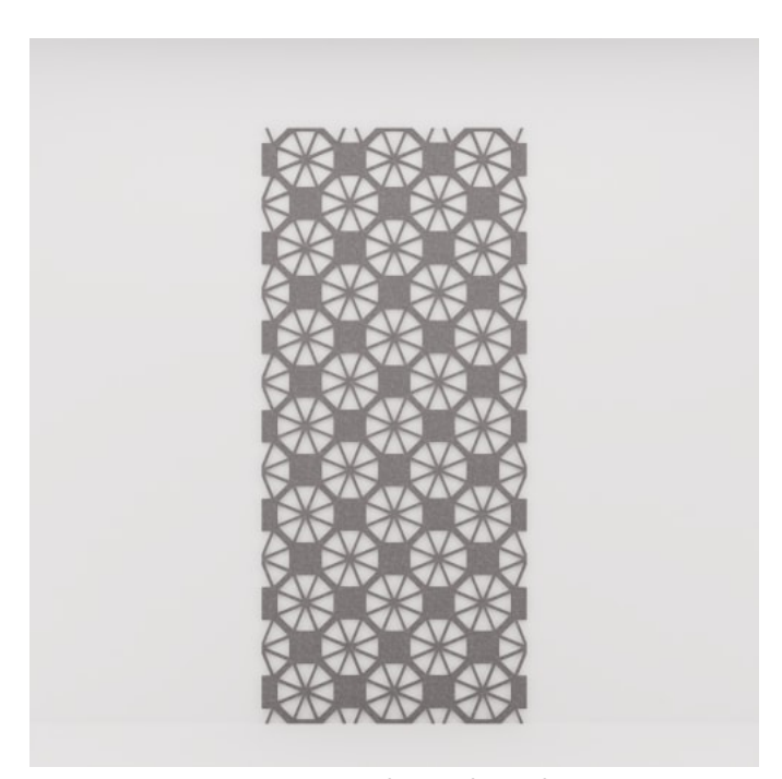
Pattern Panel Bengal Detail