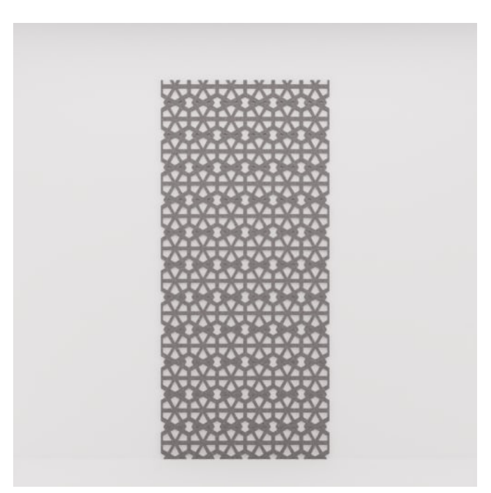
Pattern Panel Kali Detail