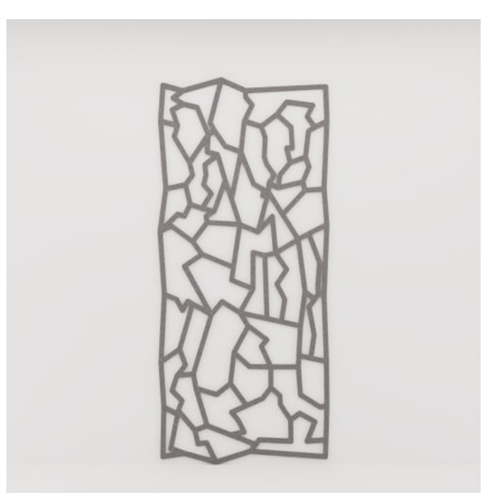
Pattern Panel Siptical A Detail