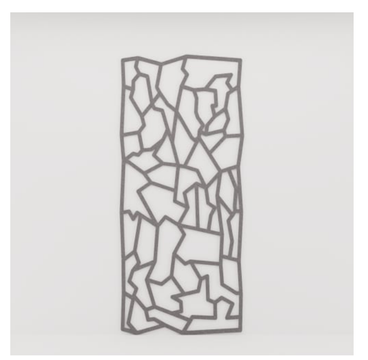
Pattern Panel Siptical B Detail