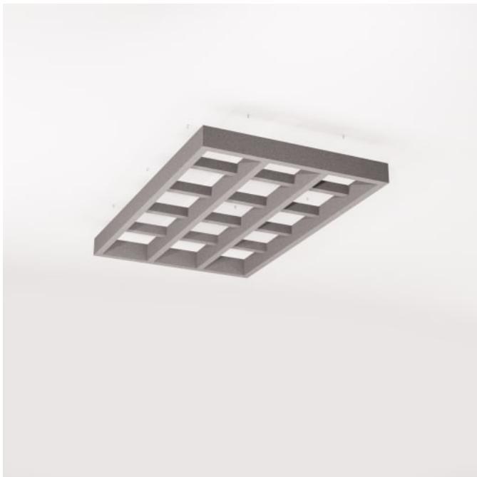
Beams Closed Rafter 3 x 5 Detail