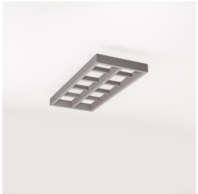
Beams Closed Rafter 2 x 5 Detail