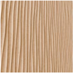
Emboss Panel Rivulet Detail Ecu