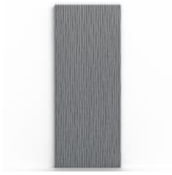
Emboss Panel Rivulet Detail Ecu