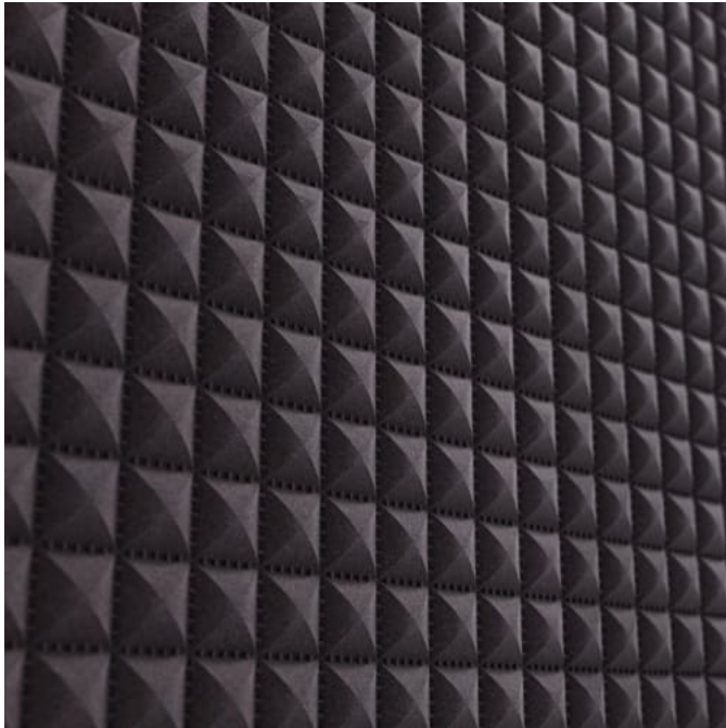
Emboss Panel Stitched Detail Elderberry