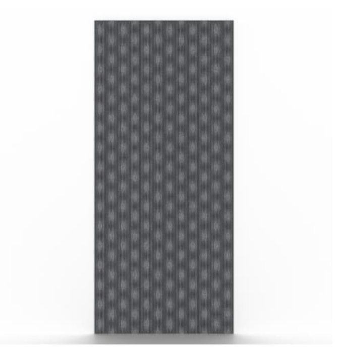
Etch Panel Billow Detail