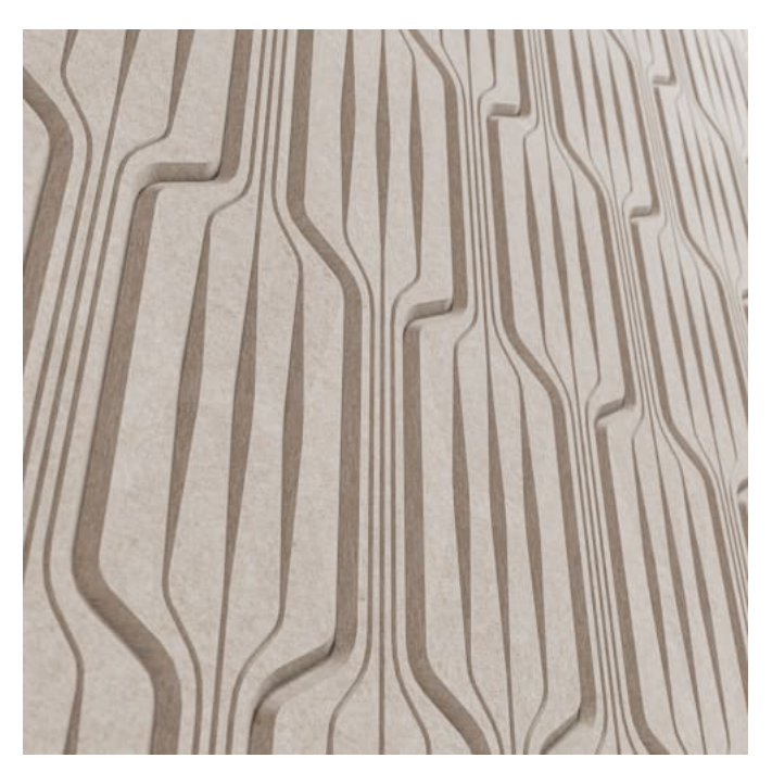
Etch Panel Demi Detail - Linen