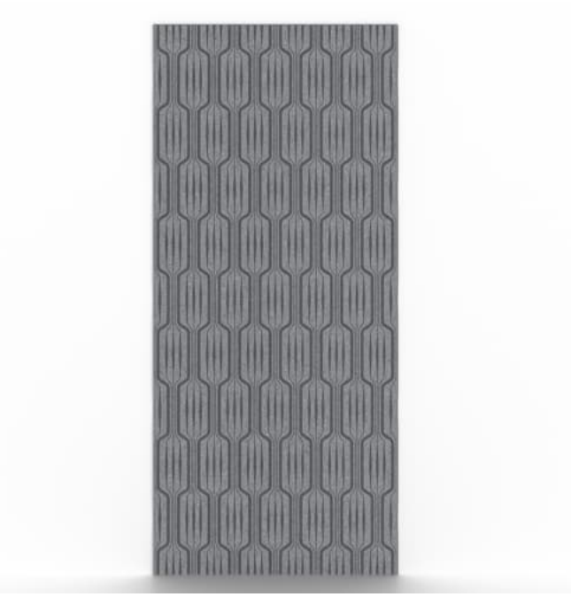
Etch Panel Demi Detail