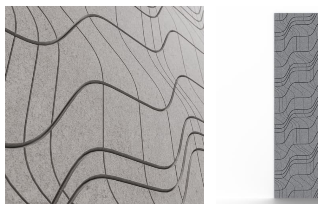
Etch Panel Suffuse Detail - Greige